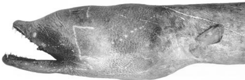
Fig. 2. Head of holotype of Aplatophis zorro , USNM 360118, 1039 mm TL.

opening height ~29; pectoral fin length 27.7; pectoral fin base 11.0; isthmus 23.5; eye diameter 4.7; interorbital distance ~23; gasbladder length 98; gasbladder width 35. Total vertebrae 120; predorsal vertebrae 19; pre-anal vertebrae 56. 19 right and 20 left branchiostegal rays. Total lateral line pores 122; 12 pores before gill opening; 57 pores before anus.