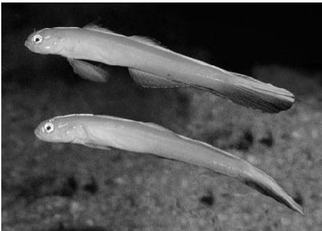
Fig. 3. Ptereleotris carinata n. sp., Mexico.

Remarks: The absence of any morphological or meristic differences between adults from Mexican and Panamanian populations (Tables 1 & 2) suggests continuous gene flow along the eastern Pacific mainland. Although Pacific reef habitat is apparently absent from most of Central America north of Costa Rica as well as southern Mexico, the habitat of mixed mud or fine and coarser sand substrata probably permits a fairly continuous extended population along this vast stretch.