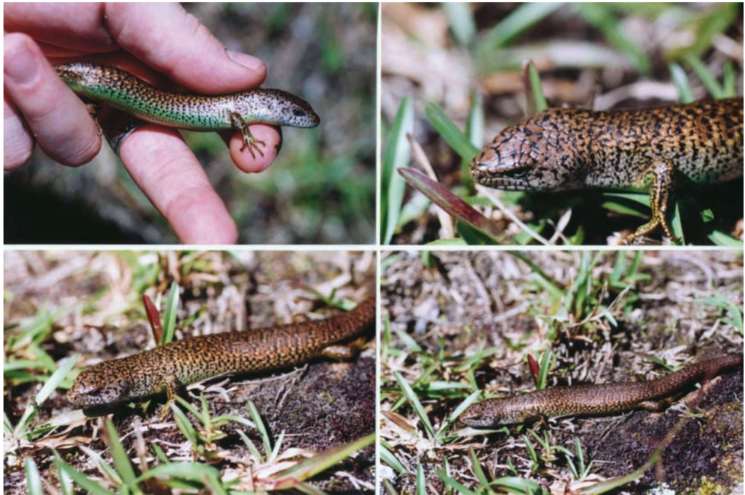
Fig. 3. Celestus orobius from Costa Rica: Provincia de San José: Parque Nacional de Chirripó Grande, 1 800 m.