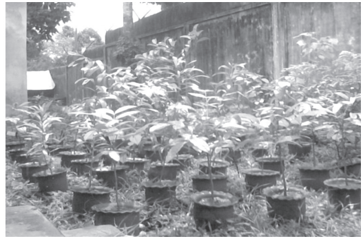
Fig. 1. Germination test (left side) and growth performance assessment by pot culture (right side) on natural forest soil and deforested soil at Dulahazara, Bangladesh.

S. grande were raised in earthen pots in Dulhazara Safari Park. These species were chosen for the experiment because they are normally found in plantation forests in this region. For the experiment, soils were collected at a depth of 0-25cm from both natural forest and deforested land of Dulhazara Safari Park in 31 October, 2007. From each land use, five soil samples were collected randomly and mixed together to fill the pots. The earthen pots of diameter 25cm and height 30cm were used for the experiment. For each species five pots were filled with soils from natural forest and other five with deforested soil. Same sized seedlings of one and half month aged were uprooted from the experimental seedbeds of germination and directly planted on each of the pots in October 31, 2007. Pots with forest soils were kept within the Safari Park and pots with deforested soils were set up in the adjacent deforested land. Watering was done in a controlled way to avoid the leaching out of nutrients from the soil.